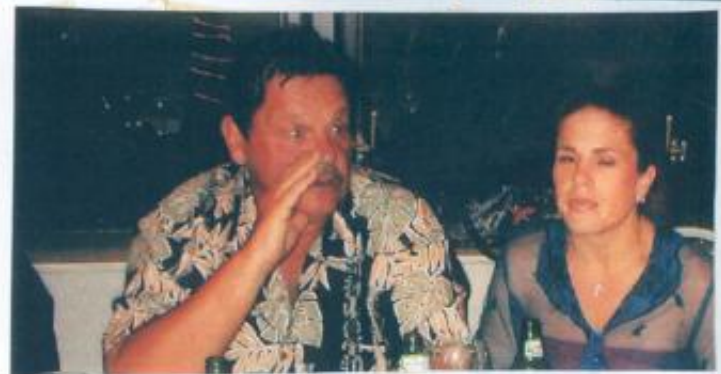
Hey! Wait till you hear this!